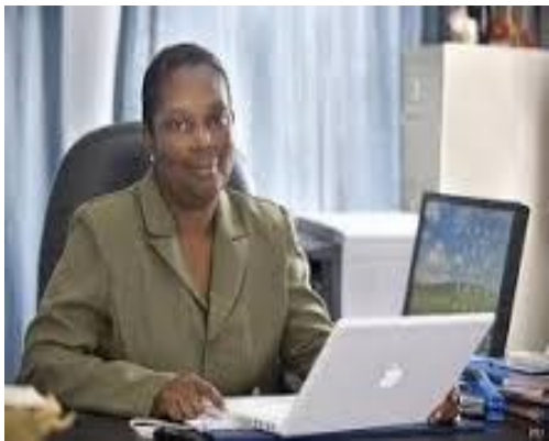
Dr. Bernice Dahn MD, MPH Minister of Health

Dr. Dahn received degree of Doctor of Medicine in 1996 from the A.M. Dogliotti College of Medicine, University of Liberia and a Bachelor of Science in Zoology degree in 1987 from the T. J. Faulkner College of Science & Technology, University. She also earned a Master's of Public Health in 2005 from the School of Public Health & Community Medicine at the University of Washington. She has 19 years of experience as a public health physician, administrator, policy-maker and educator. This experience includes her previous assignment as Deputy Minister and Chief Medical Officer of the Republic of Liberia for approximately eight years with oversight of about 150million USD of projects. Her role has included leadership, supervision