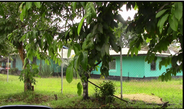
A View of Unification Town Clinic in Margibi County

were re-integrated in their respective communities. The health workers completed their 21 days observation period when none of them showed signs and symptoms of the Ebola virus Disease. During the period of observation for signs and symptoms of the EVD the health workers were provided with food and other psychosocial support..