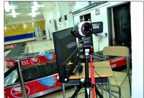
Pres. Sirleaf Takes a glance at the Thermal Scanners

President Ellen Johnson Sirleaf has expressed confidence that the recent outbreak of the Ebola virus disease outbreak in lower Margibi County will soon be put under control. "I am confident that the situation will be put under control," she asserted. The Liberian President made the statement at the Robert International Airport (RIA) where she inspected the three brand new electronic scan-