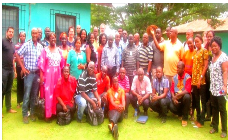
Participants at the Community Health retreat

The Community Health Retreat was conceived by the Community Health Services Division and its partners and was held from May 27-29, 2015 in Gbarnga, Bong County. Over 100 participants from 50 organizations, governmental and non-governmental programs were in attendance, including Ministry of Health (MOH) departments and County Health Team representatives, UN agencies, bilateral and donor agencies, local NGOs, and international NGOs.