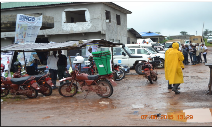
Partial View of Needowein Community in Margibi County

Profiles of newly confirmed Minister of Health and two Deputies