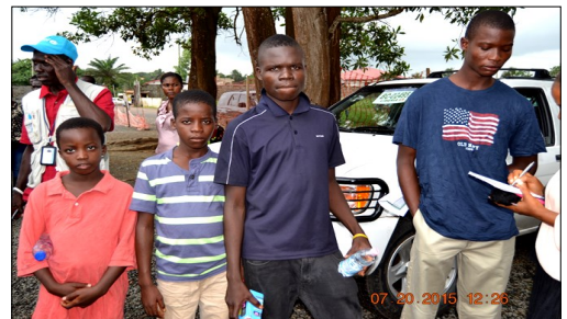
Four of the Survivors at the ELWA ETU

The remaining confirmed Ebola cases in the Third Wave were discharged from the ELWA Ebola treatment unit the week of July 20, 2015.